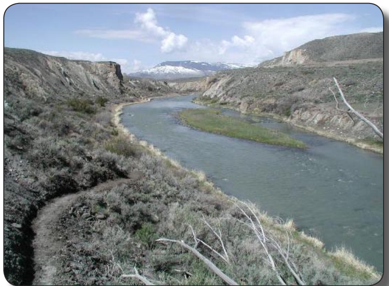
Cooper Lane Trail to the Shoshone River, Cody, WY— Built by EYTU Chapter volunteers, allowing better fishing access.