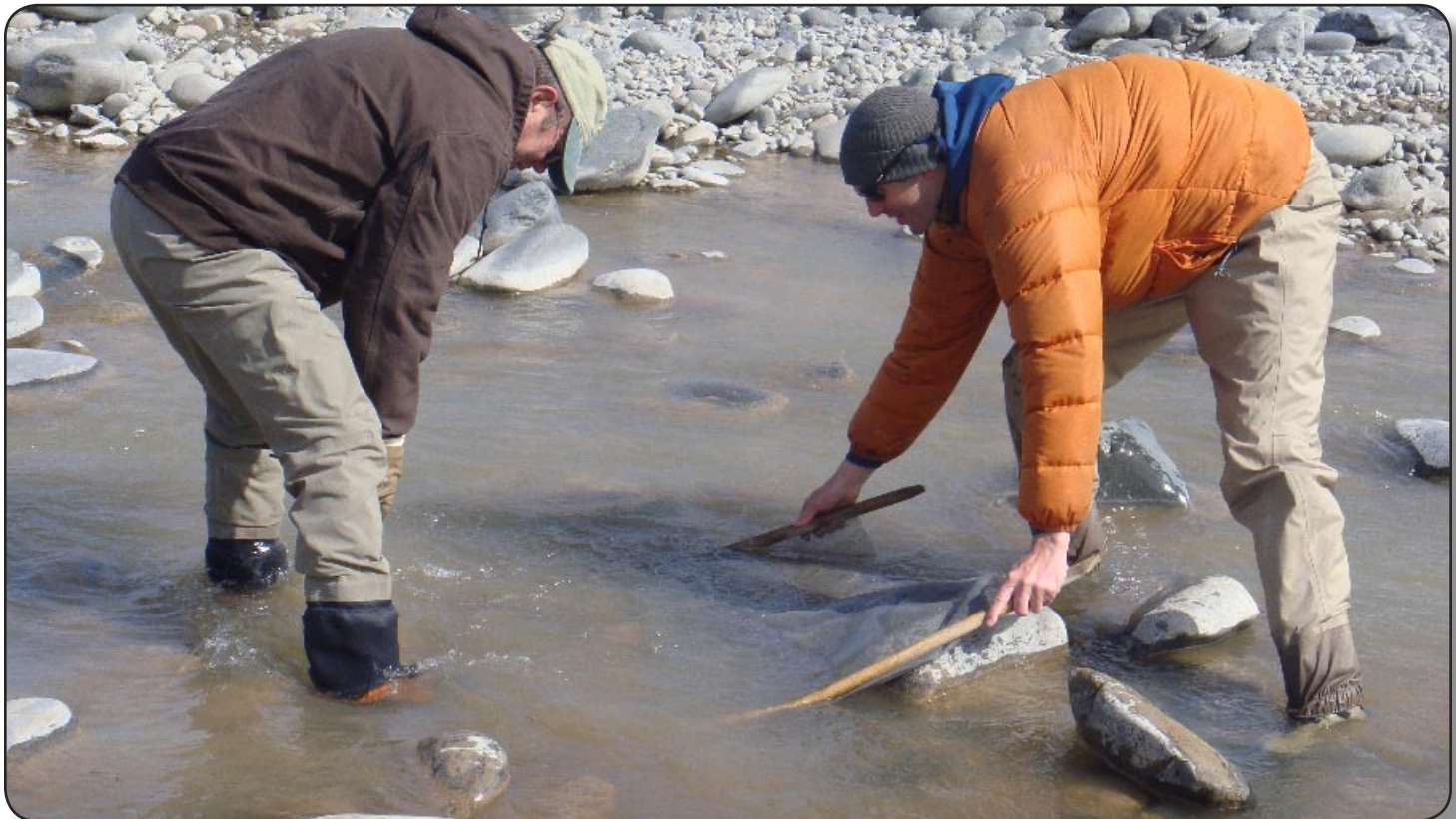
Let's see what lurks beneath. Entomologically speaking, of course...