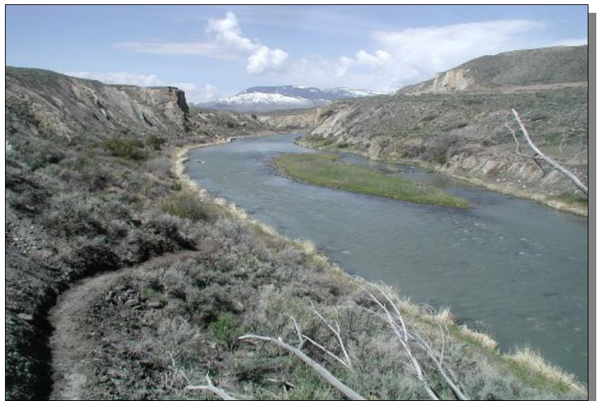
Cooper Lane Trail to the Shoshone River, Cody, WY—built by EYTU Chapter volunteers, allowing better fishing access.