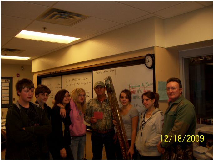
Cody High School FFA students receiving 'thank you' gifts from East Yellowstone Trout Unlimited.